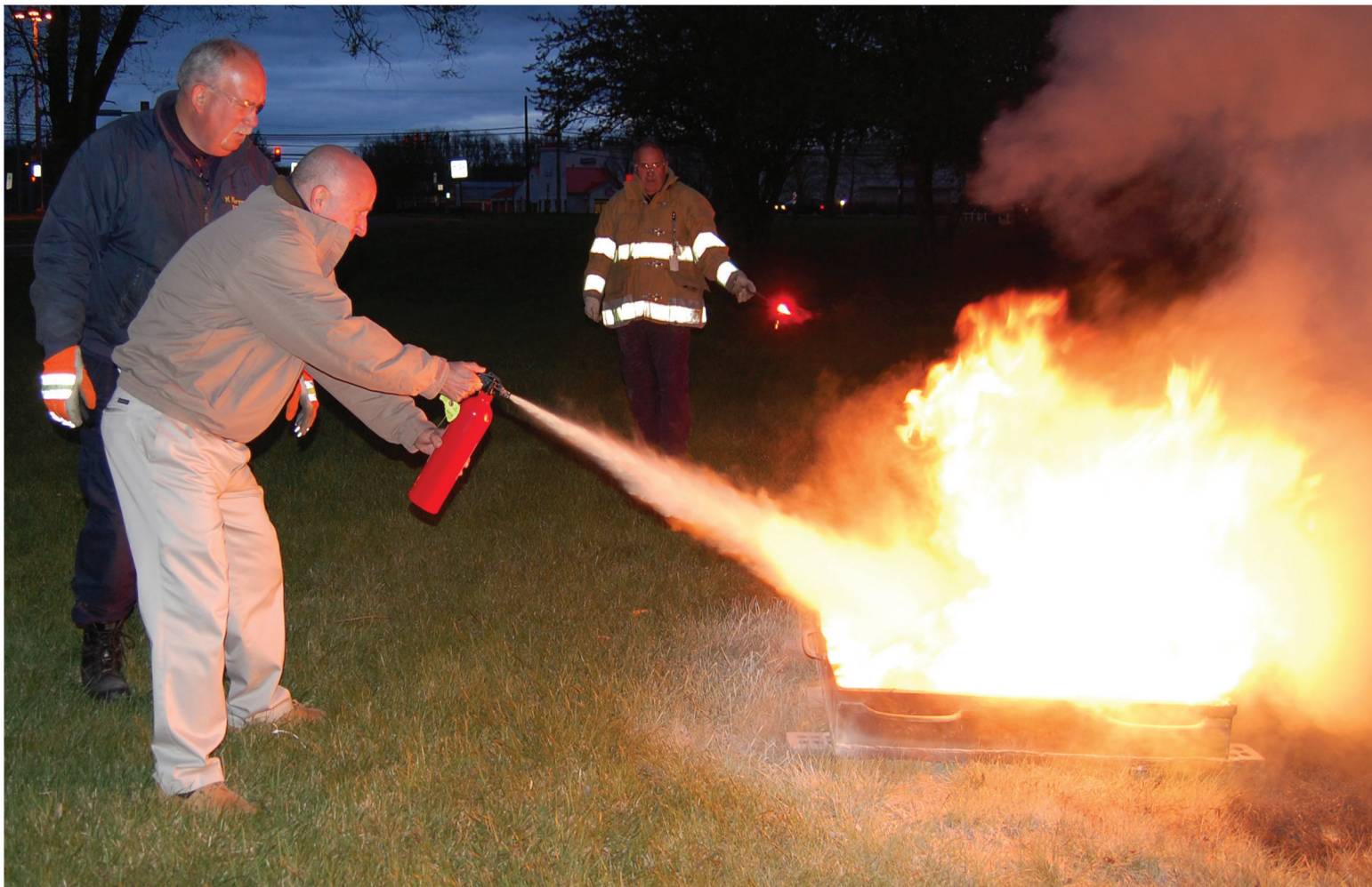
How to use a fire extinguisher is just one of the topics included in the Citizens Fire Academy, starting in April.