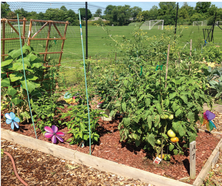
There are 46 plots available at the Community Garden.

The days are getting longer, temperatures are rising, trees are awakening from the winter slumber, and the garden section of the home centers are filling with live plants and seeds. It's springtime. If you are itching to dig in soil and plant tomatoes, peppers or your favorite flowers and have no place for a garden, the Falls Township Community Garden can help.