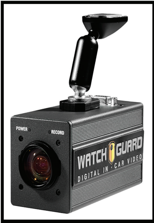
Dual front and rear in-vehicle cameras will be installed into two Falls Township police cruisers.