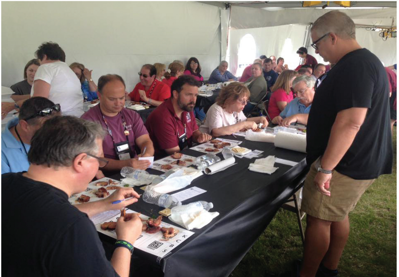
Lucky diners at this year's Que for the Troops will have 75 menus to choose from.