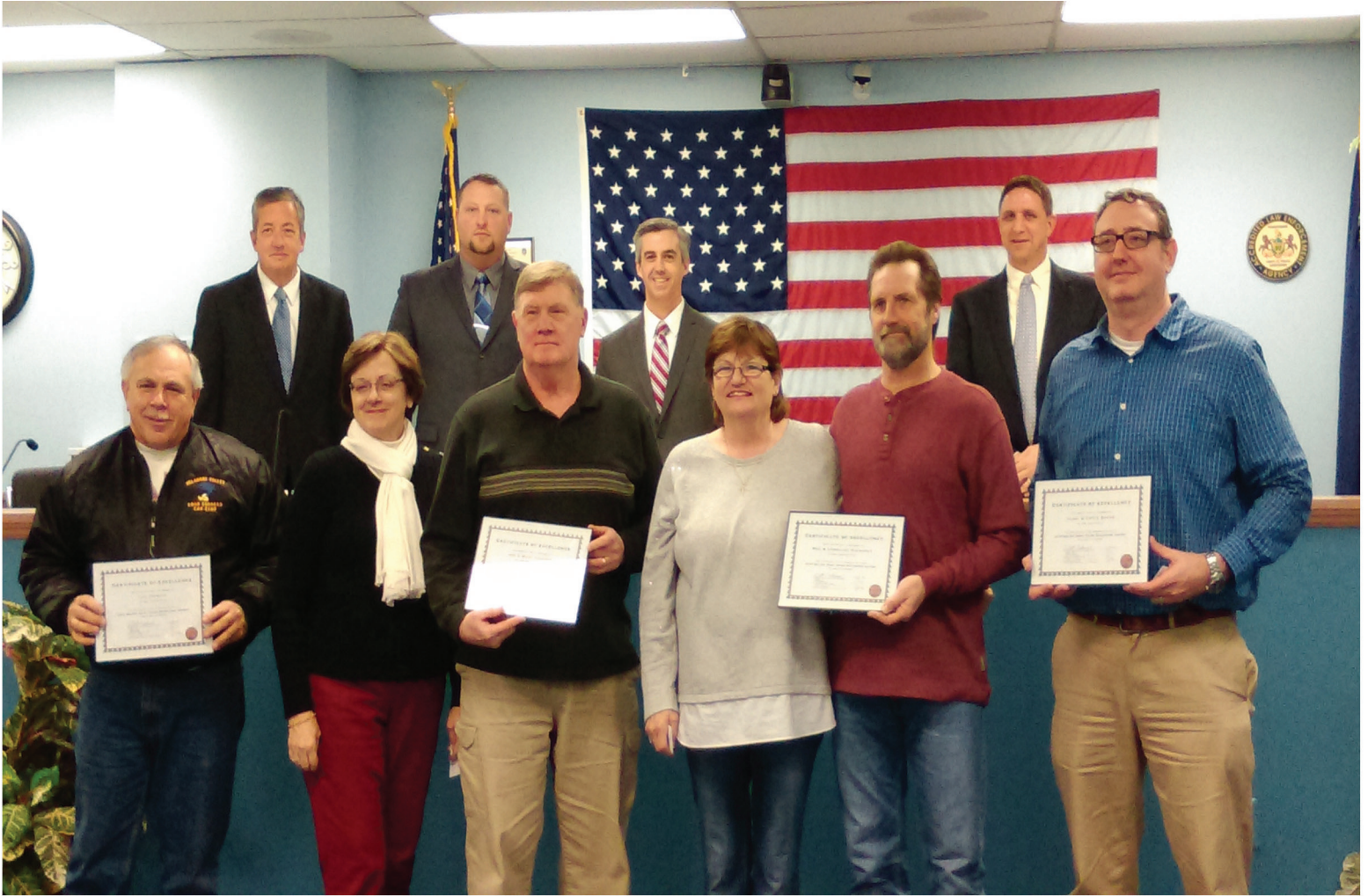
Winners of the Falls Township holiday decorating contest were recognized during a recent Supervisors meeting.