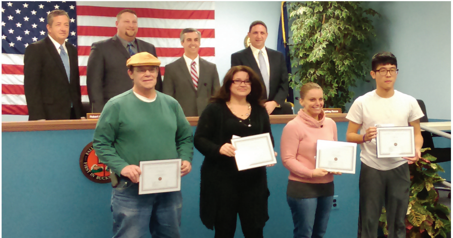
Four of five winners of the Falls Township photo contest were awarded prizes during a recent Supervisors meeting.