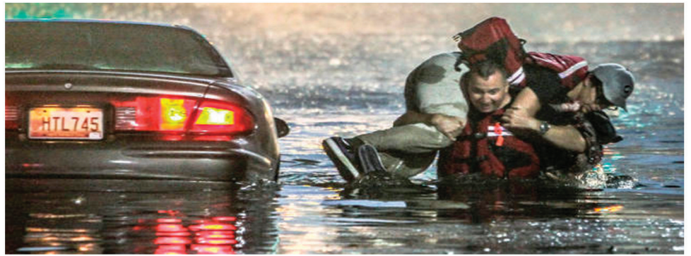
Penalties will be levied if motorists have to be rescued during flooding.

"We'd like to ease them in," the Chief said. "That way it's not a burden to the Township."