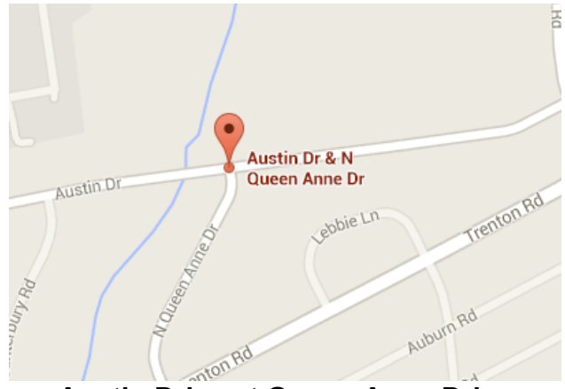
Austin Drive at Queen Anne Drive

Alden Avenue later prompted additional NTAC complaints. As a result, the police department issued 122 citations from Memorial Day through July 4<sup>th</sup>.