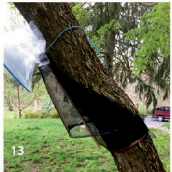
12. Cut along the edges of the zip-type bag just enough to slip it over the plastic top. Secure it with a zip-tie. 13. The finished trap secured to a tree.